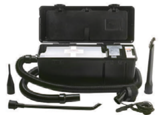
HEPA Vacuum System